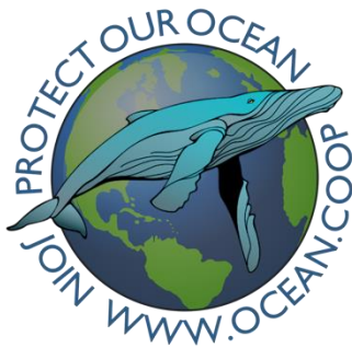
Ocean Health Coop contact@ocean.coop