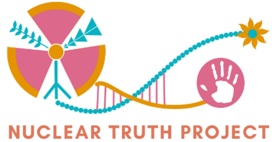
Nuclear Truth Project