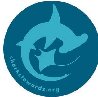
Shark Stewards sharksteward@gmail.com