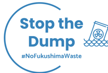
Save the Pacific Ocean savethepacific@protonmail.com