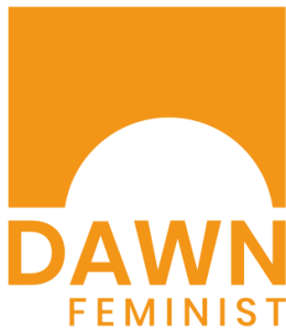
Development Alternatives with Women for a New Era (DAWN)