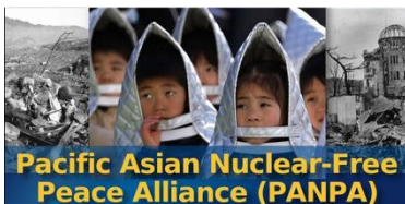
Pacific Asian Nuclear-Free Peace Alliance forfuturefukushima@gmail.com