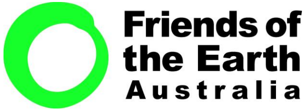
Friends of Earth Australia (FOEA)