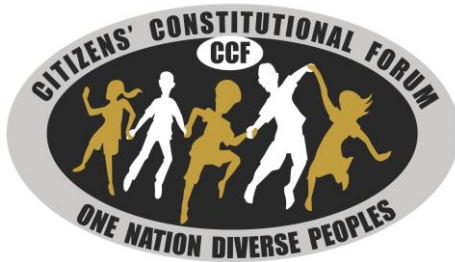
Citizens' Constitutional Forum (CCF)