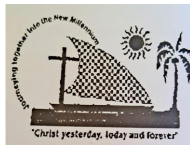
Fiji Council of Churches (FCC)